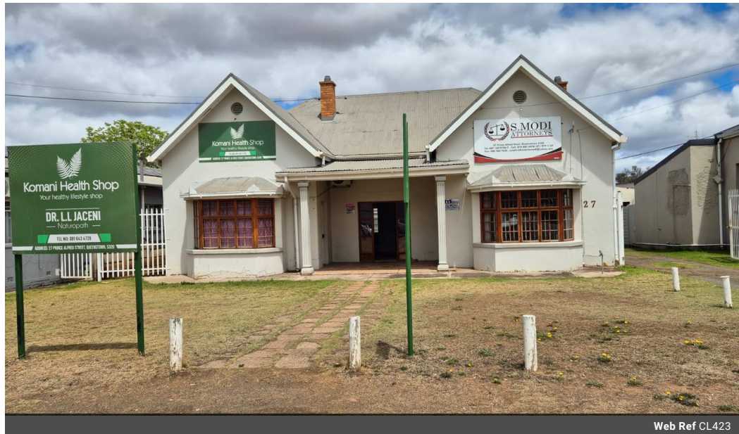
Web Ref CL423

27a Prince Alfred Street Queenstown 5319