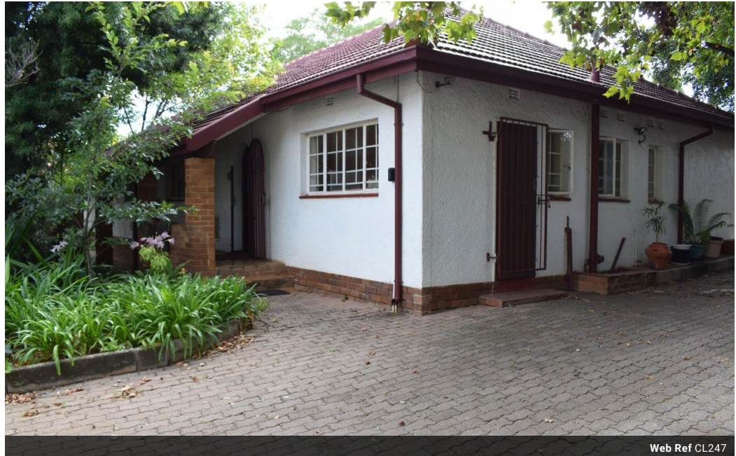
Web Ref CL247

34 6th Street Parkhurst Johannesburg 2193