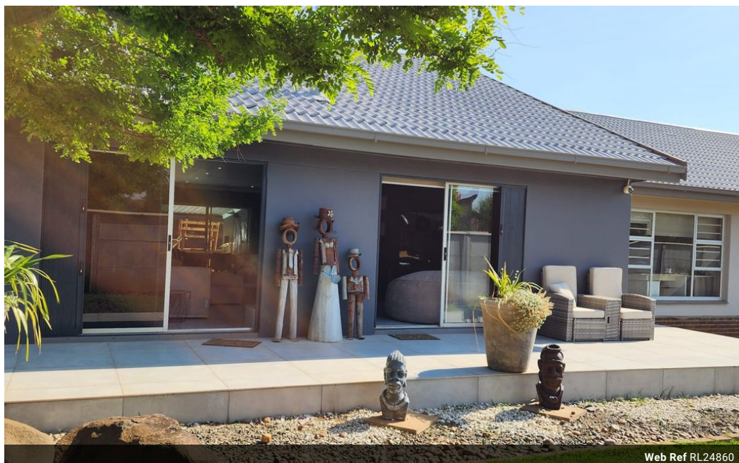
Web Ref RL24860

355 Stateway Doorn Welkom Free State 9460