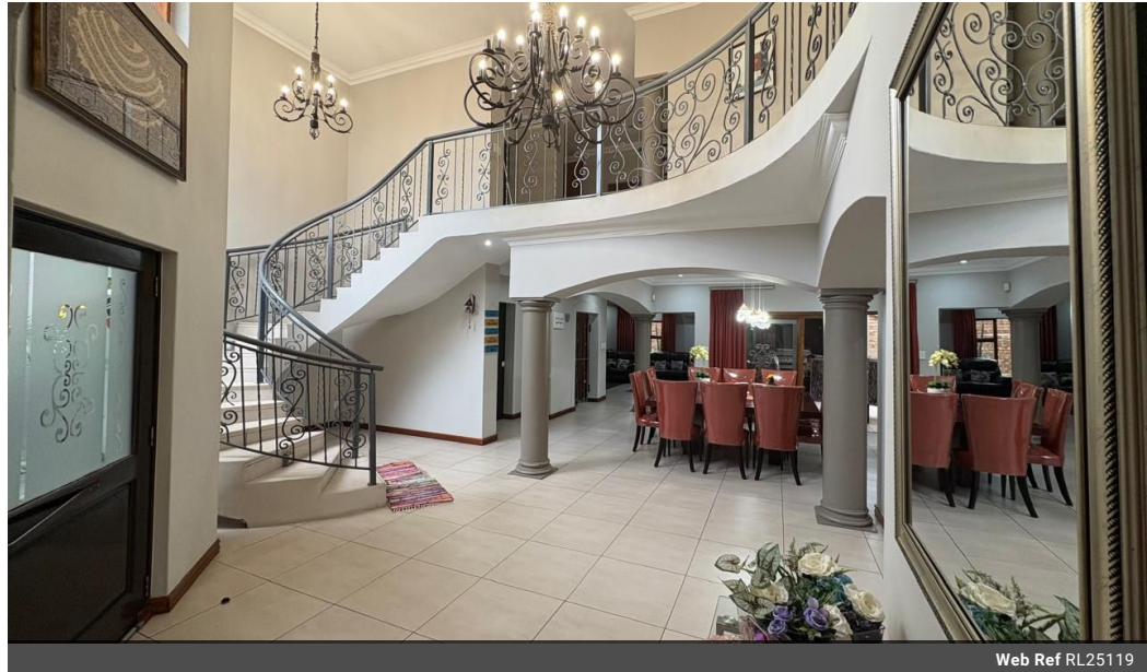
Web Ref RL25119