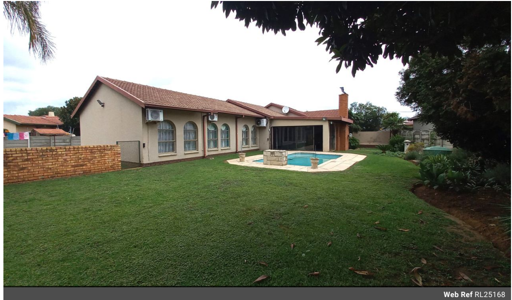
Web Ref RL25168