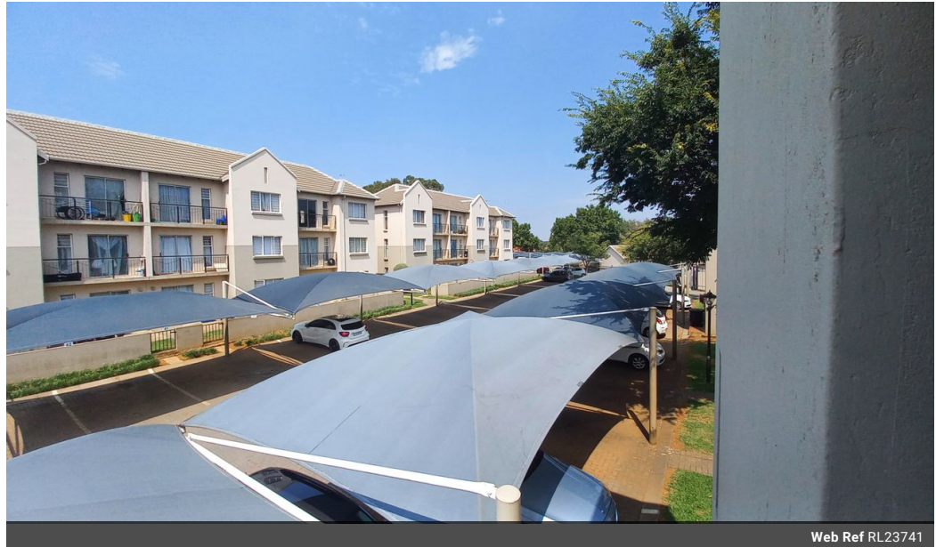
Web Ref RL23741