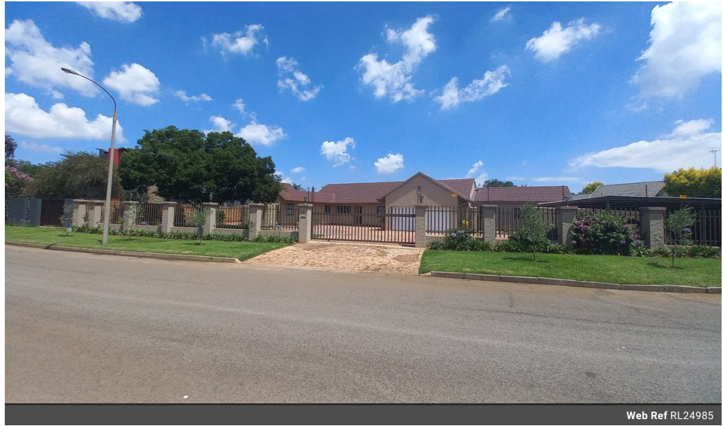
Web Ref RL24985