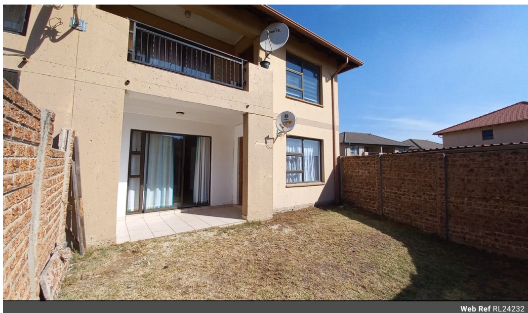
Web Ref RL24232