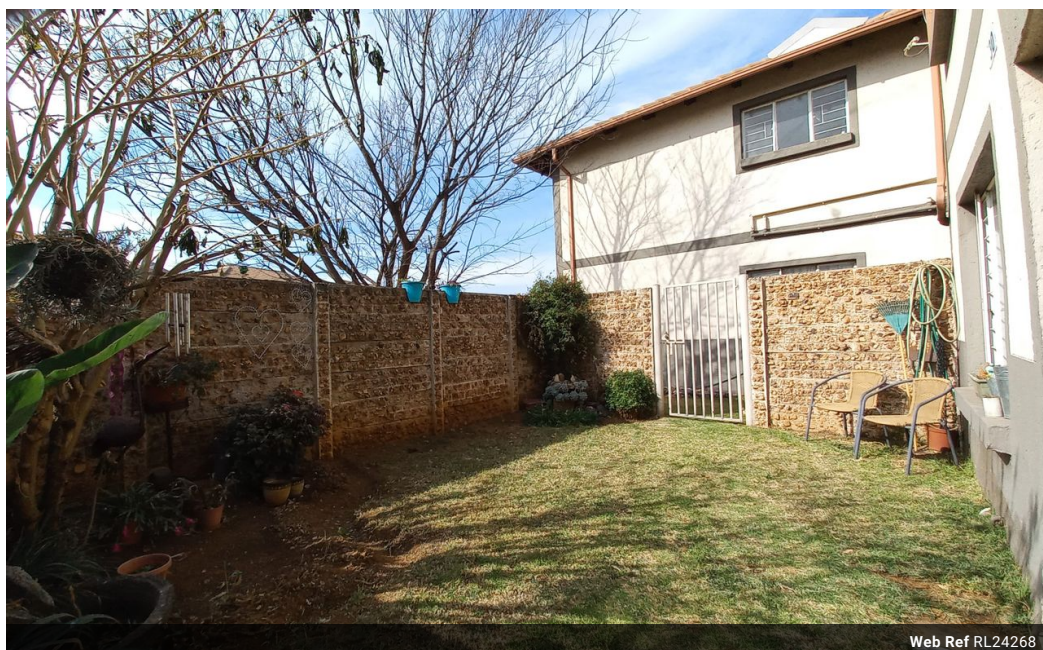
Web Ref RL24268