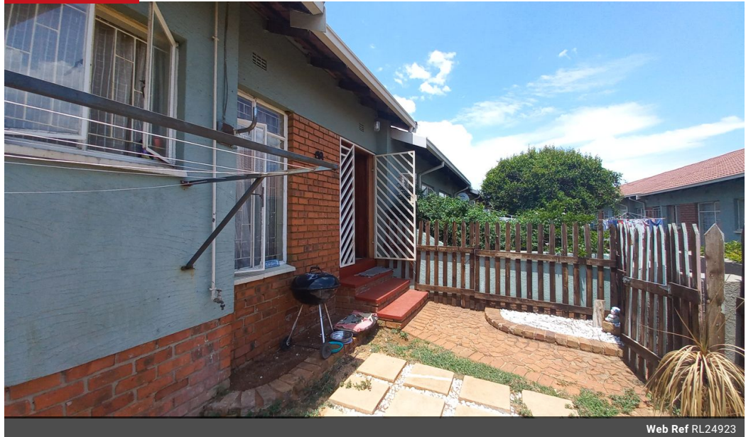
Web Ref RL24923