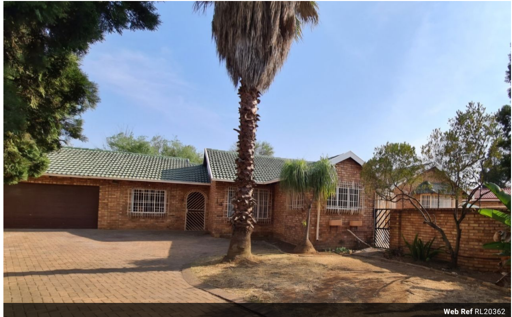
Web Ref RL20362