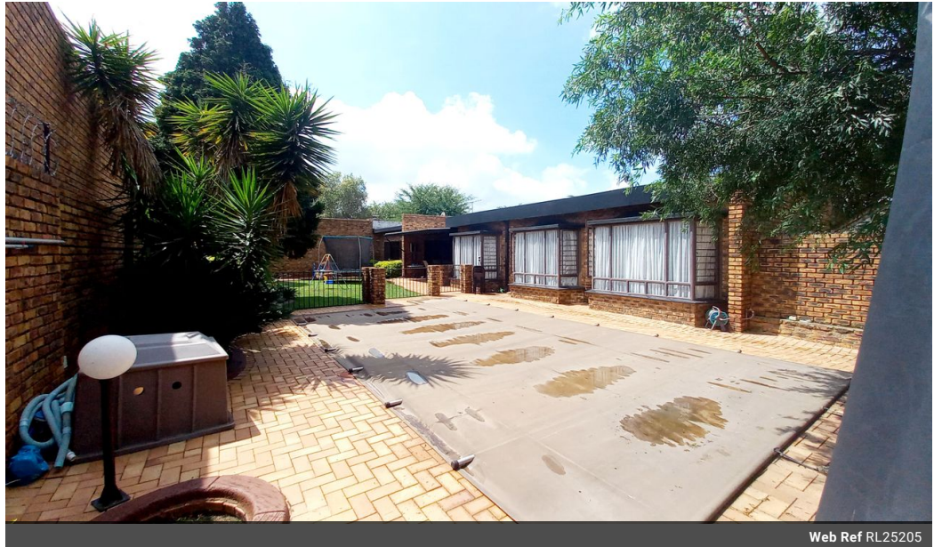
Web Ref RL25205