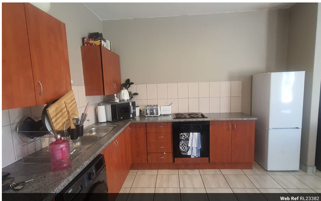
Web Ref RL23382