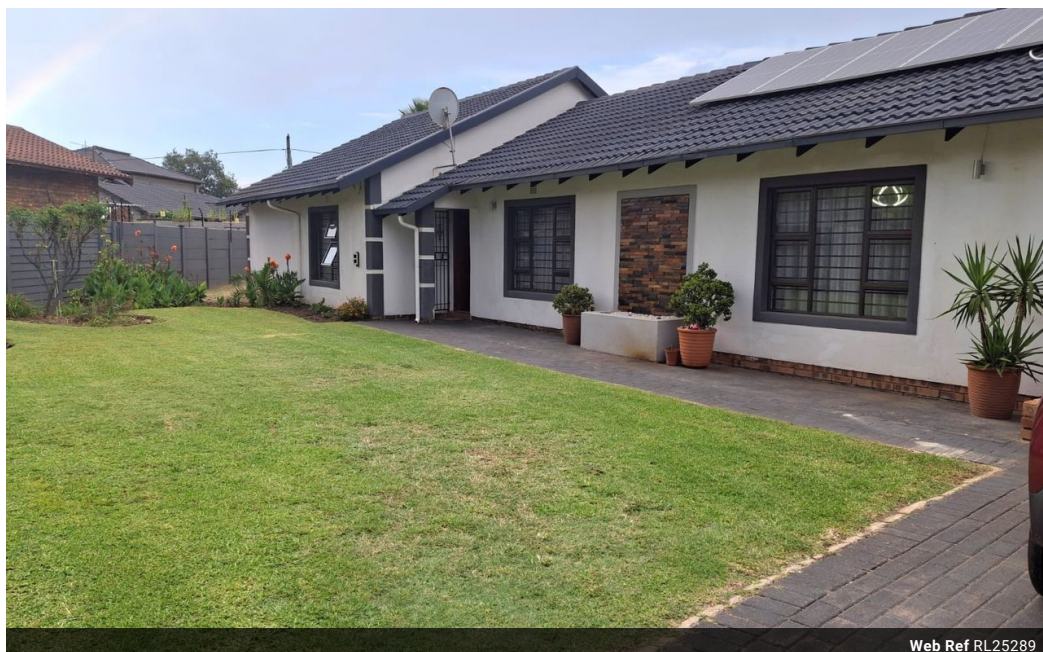
Web Ref RL25289