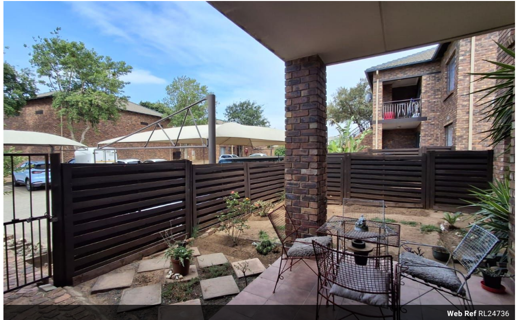
Web Ref RL24736