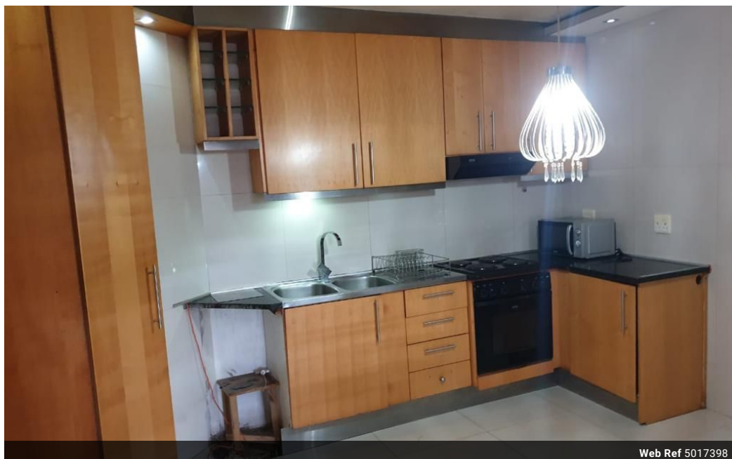
Web Ref 5017398

3 Nordale Close, Zevendal, Kuils River, 7580