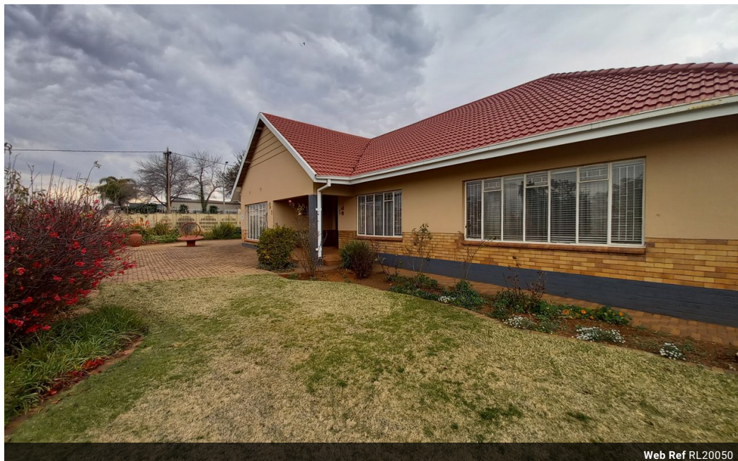
Web Ref RL20050

59 Monica Avenue Flamwood Klerksdorp 2571