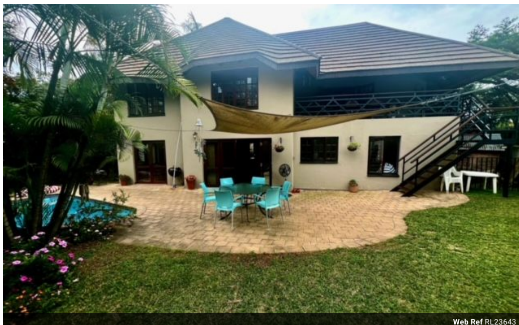
Web Ref RL23643