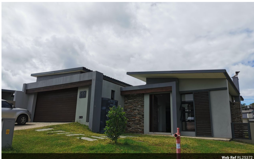
Web Ref RL25372