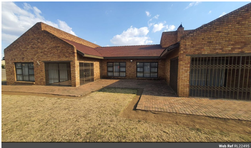
Web Ref RL22495