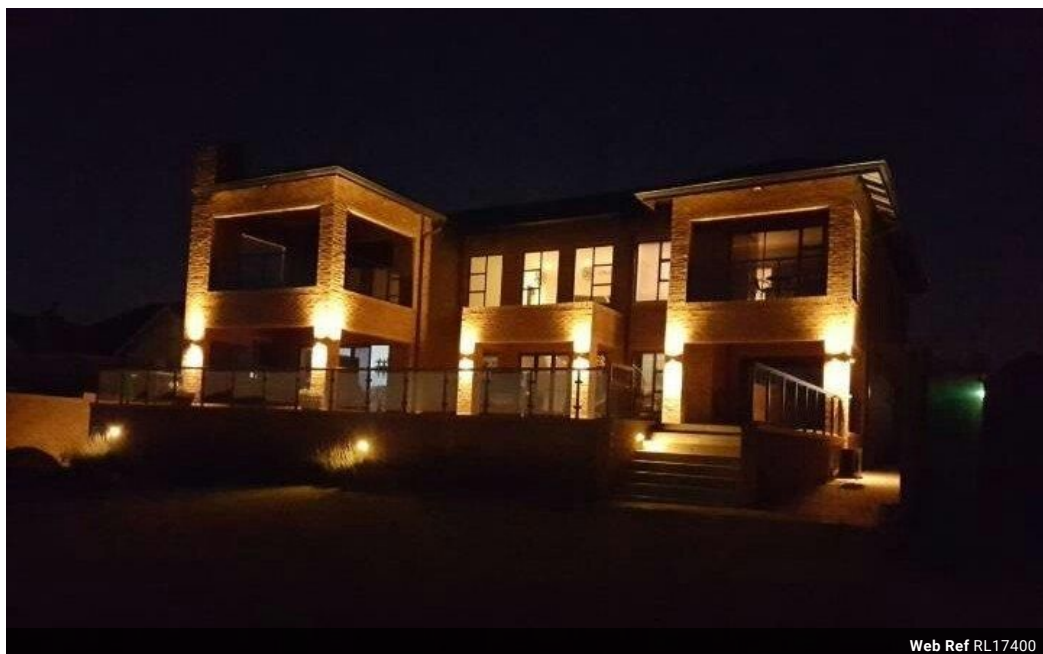
Web Ref RL17400