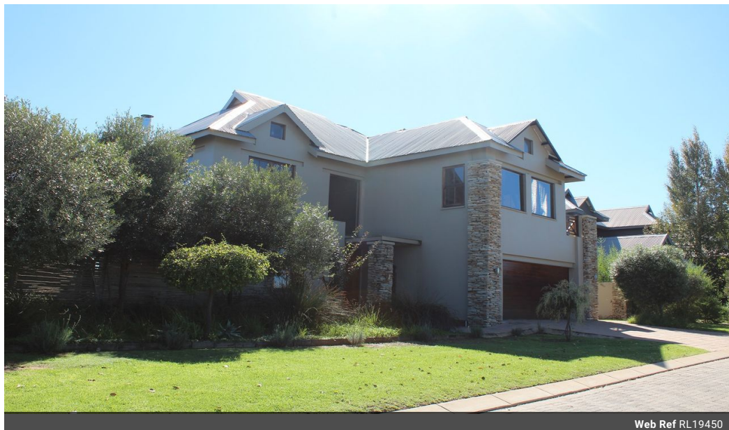
Web Ref RL19450