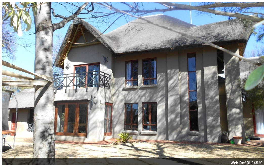
Web Ref RL24520