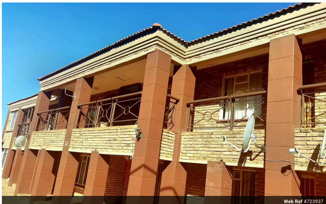
Web Ref 4723937

Unit 11 HU Trust Building Cnr Nelson Mandela and Parys Avenues Potchefstroom 2526