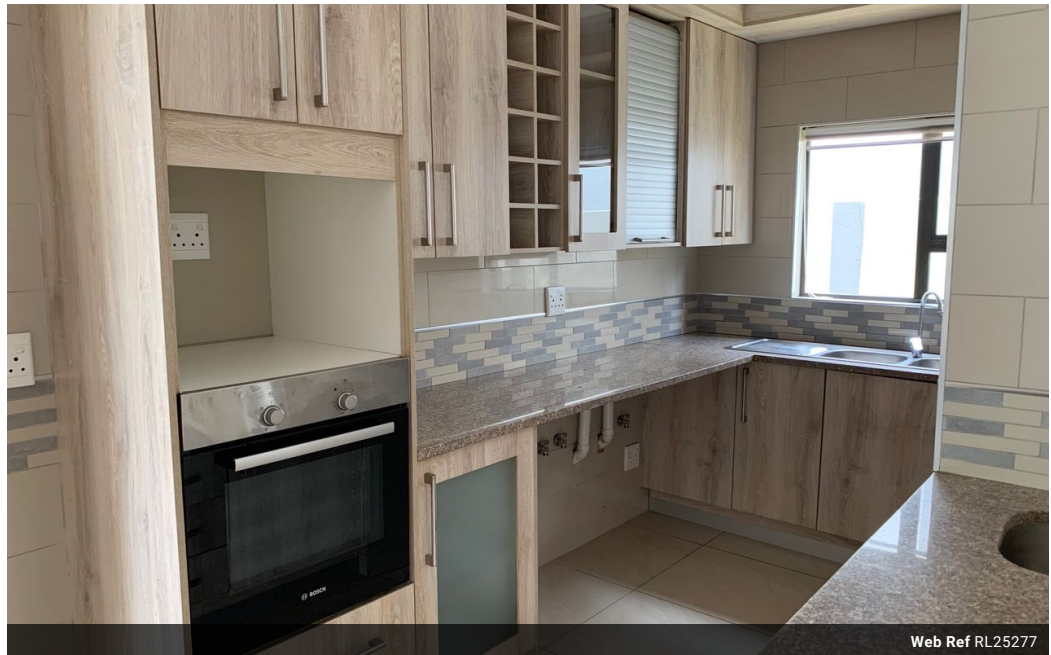
Web Ref RL25277

1st Floor, 59 Regency Drive, Route 21 Corporate Park, Irene, 0174