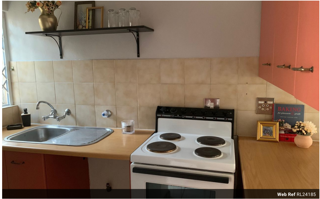
Web Ref RL24185