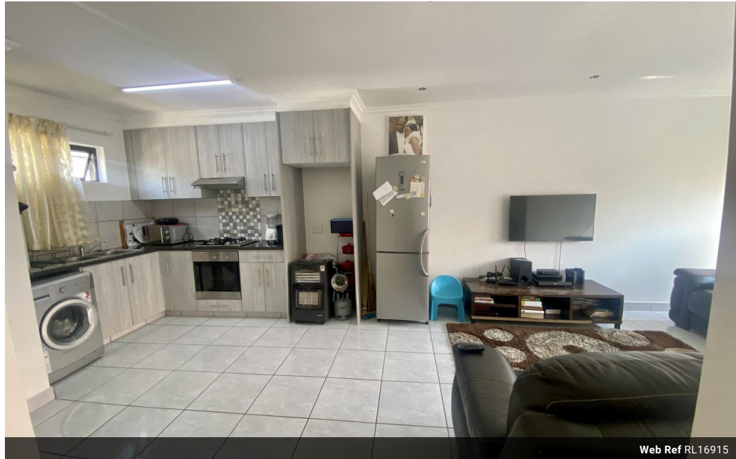
Web Ref RL16915