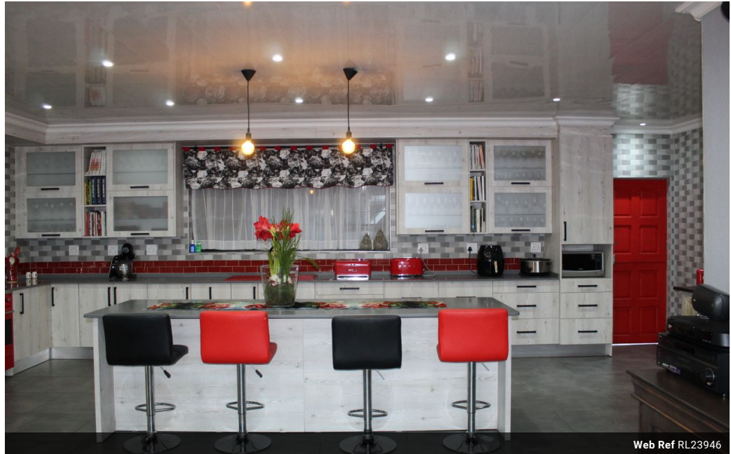
Web Ref RL23946