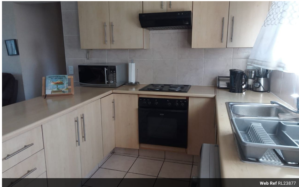
Web Ref RL23877