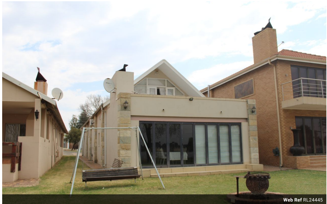
Web Ref RL24445